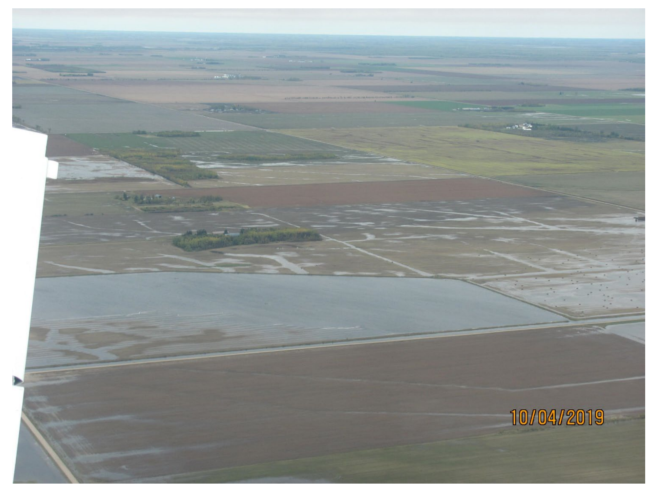
Looking south – Section 6 Barto Twp Roseau Co. Lat1 SD95 in foreground